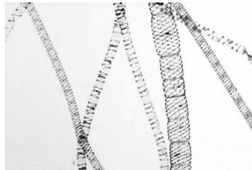
Magnification \times 200

(a) (i) Put a cross in the box next to the term that describes the process involved in the cell divisions in a filamentous alga. (1)